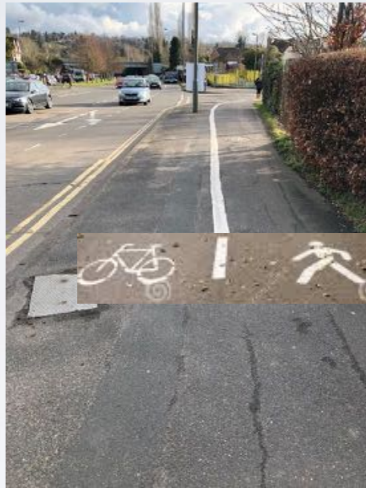
Painted signs would make it clear.