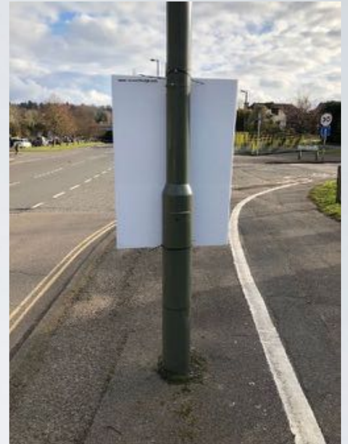
Lamp post in middle of cycle lane despite representations and installation contract.