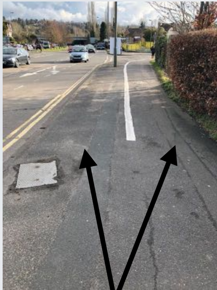
No indication as to who the lanes belong to.